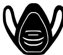
Protective Clothing Pictograms